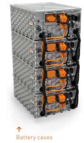
↑ Battery cases