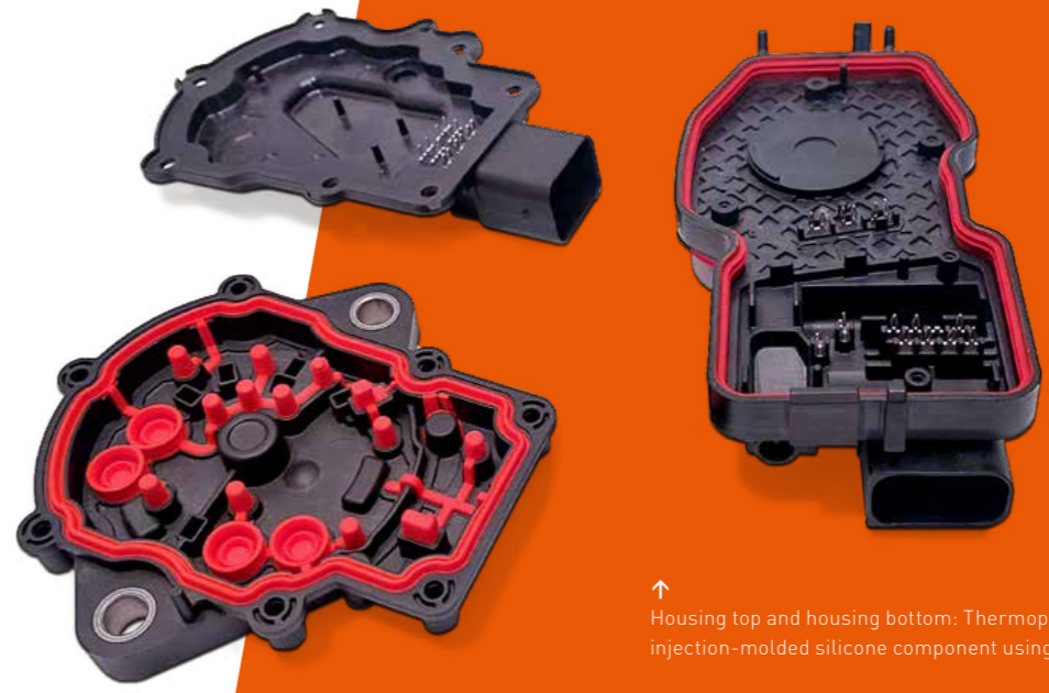
↑ Housing top and housing bottom: Thermoplastic resin with injection-molded silicone component using KTL® INJECTION

Complementary end-to-end engineering services and the supply of innovative finished parts create a win-win situation for our customers. While Kegelmann Technik supports Elteka customers in product development, Handtmann Elteka supplies Kegelmann Technik with materials. In close cooperation with customers, suppliers, and research institutes, we develop economical, high-precision, and reliable applications. Join us in shaping the future of materials and finished parts with your expertise.