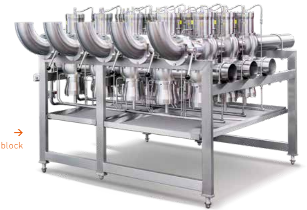
→ Valve block