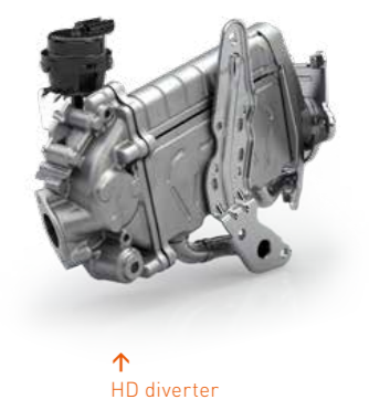
↑ HD diverter