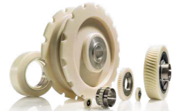
↑ Rollers, chain wheels and toothed wheels made from LTK® Pure and LTK® Metal Core