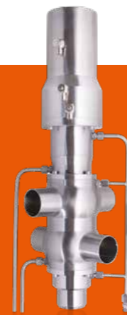
↑ Double-seat valve