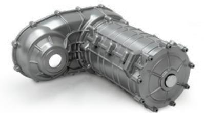
↑ Segmented electric motor housing