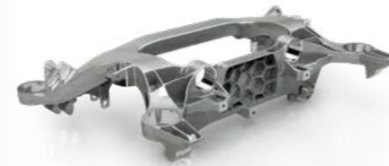
↑ Rear axle carrier