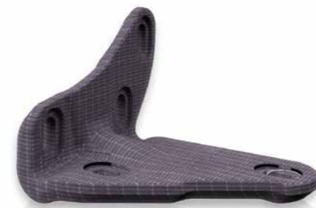
↑ Lug made from LTK® composite