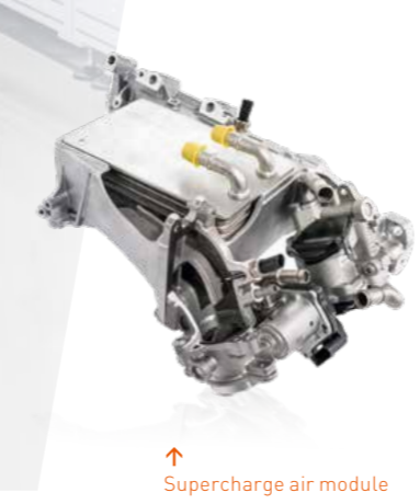
↑ Supercharge air module